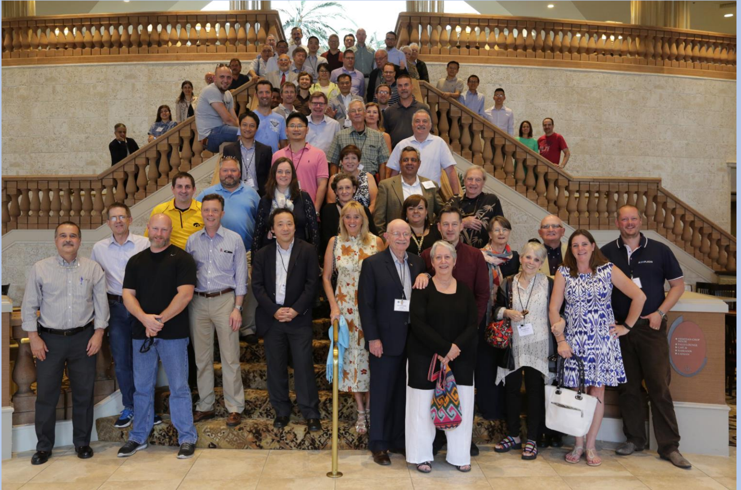
Several attendees gather on the stairs of the Caribe Royale for a photo before departing for the Group Dinner on Wednesday, June 22nd.